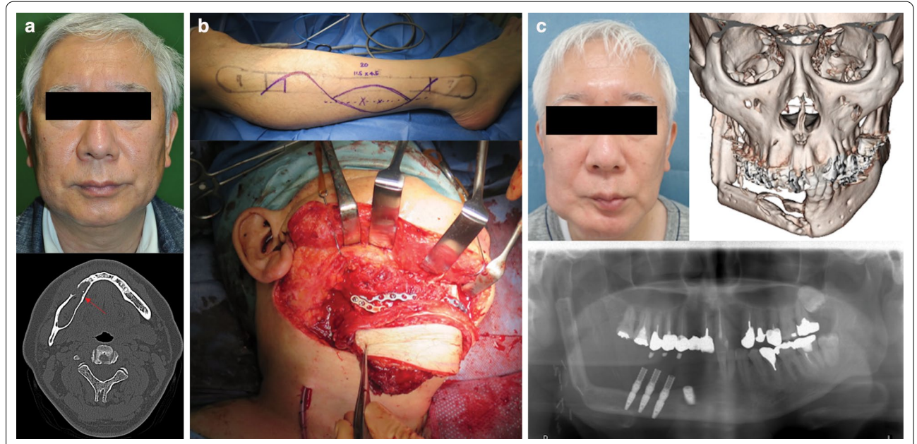
Fig. 2 a Preoperative image of the patient 2 (right, patient 4 in Table 1). In the preoperative CT, an arrow shows the affected mandible with a calcifying odontogenic cyst (right). b Free osteo-cutaneous fibula flap harvested from the right lower limb. Osteotomy was performed in two places in the 18 cm long fibula (top). The harvested free osteo-cutaneous fibula flap was transplanted into the mandibular defect using the double barrel method (bottom). c Eleven months after surgery, although the distal part of the osteo flap developed osteonecrosis, there is no tumor recurrence and both functional and esthetical results were fair. This was achieved with a successful implant installation