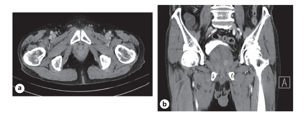
Fig. 1. Enhanced CT scan of the pelvis. Axial ( a ) and coronal ( b ) enhanced CT imaging showing no remarkable changes such as intramuscular abscesses, hematoma development, or intravascular defects. CT, computed tomography.