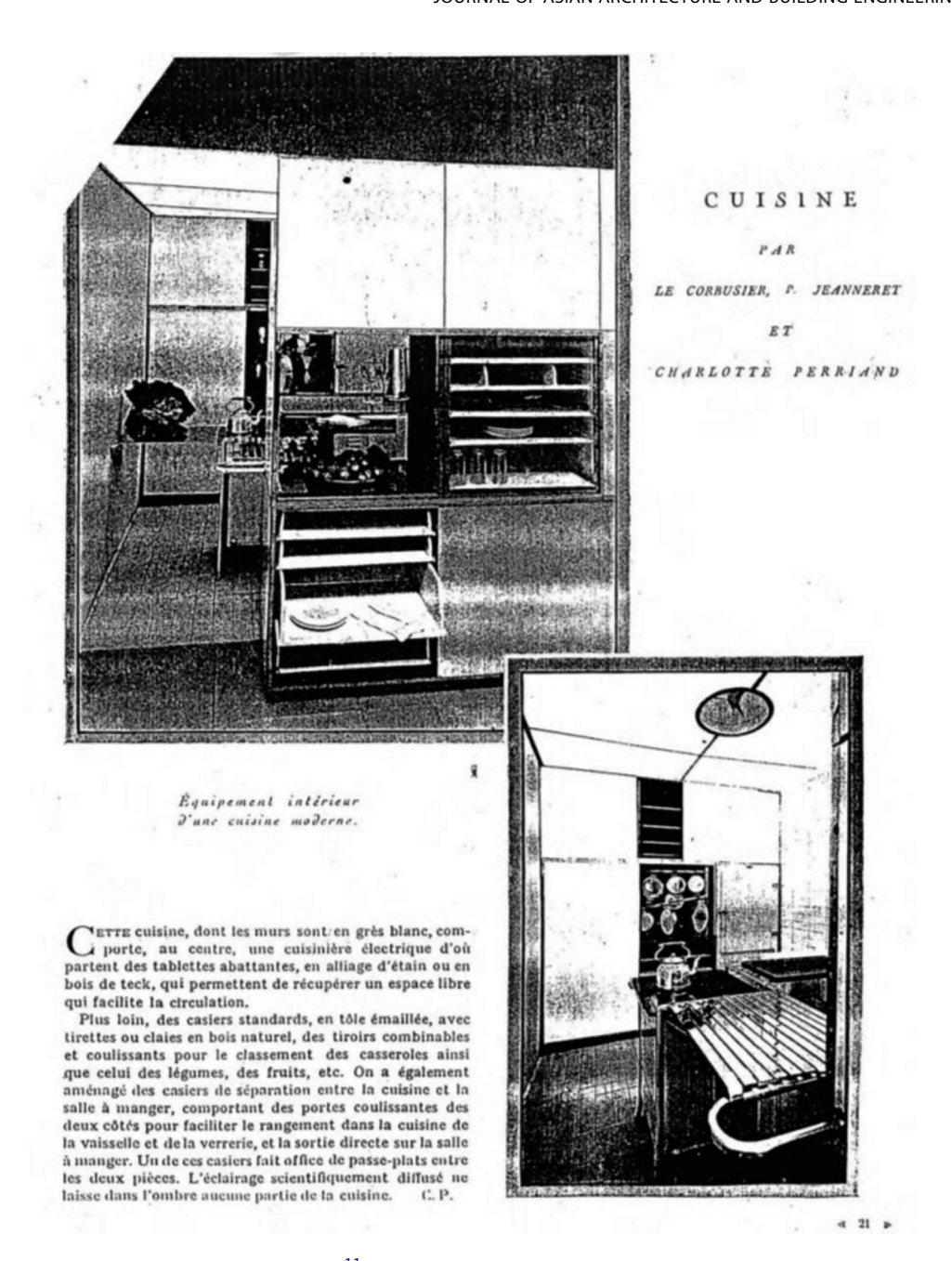
Figure 1. Interior equipment of a modern kitchen. 11 cf., Perriand, Charlotte. op.cit.

sensitively corresponded to personal will. 12 Such cabinets are not decorative at all. Rather, decorative cabinets are not compatible with free arrangement. However, she did not have Le Corbusier's deep attachment to the "incorporation into walls". She continued to pursue flexibility in living spaces to the end. This sensibility would be a main reason for "walls" or "type" fading out of her later notion of "equipment".