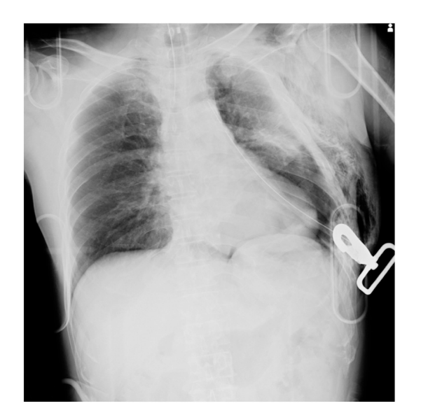
Fig. 1. Chest X-ray findings showed remaining pneumothorax after insertion of the chest drain, left rib cage deformity, and left lung contusion.