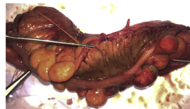
Fig. 4. In the macroscopic examination of the surgical specimen, the diverticulum communicates with the outside of the mesentery without signs of malignancy (the inserted probe penetrated the lumen).

Colonic perforation is most often due to diverticulitis, neoplasm, and iatrogenic and traumatic mechanisms. Colonic diverticulosis is common in the developed world, affecting up to 50% of adults in Western countries [10]. Among patients with colonic diverticulosis, approximately 20% may develop diverticulitis due to infection and inflammation of the diverticula [11]. Perforation of diverticulitis is one of the most serious complications and requires an urgent operation. In some previous reports, colonic perforation resulted in a free hole occurring on the opposite side of the mesentery [12,13].