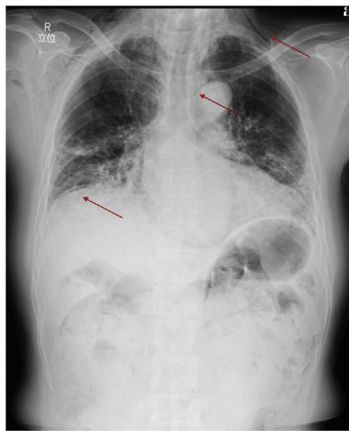
Fig. 1. Chest radiography showing subcutaneous emphysema of the neck, mediastinal emphysema, and subdiaphragmatic free air (red arrows).