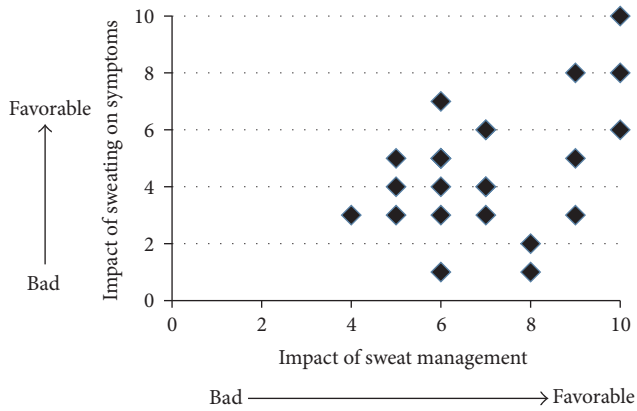
FIGURE 2: The relationship between perception of sweat and the degree of helpfulness provided by sweat management instructions at 1 month after the instructions ( N = 24 ). Spearman's rank correlation test showed a strong correlation between these values ( r_s = 0.348 , p = 0.0475 ).